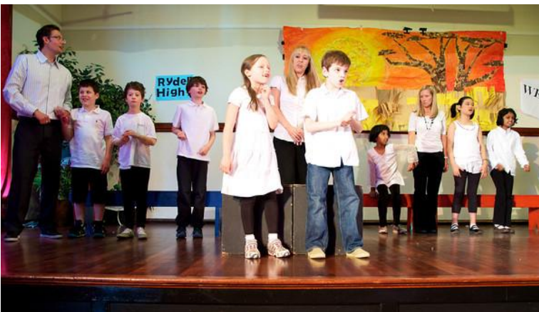
The Lion King