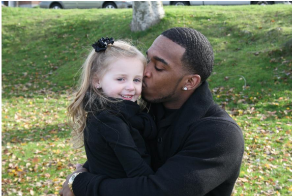
Katrina Davis Photography

We all know this is hard work – but it's essential work. We are unwavering about our core mission – to prove that all students, including typically developing and those across the autism spectrum, can successfully learn side by side within an academically challenging and socially vibrant environment. I see this success every day, in ways both big